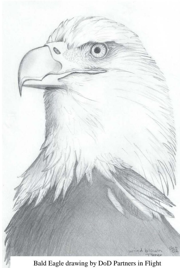
Bald Eagle drawing by DoD Partners in Flight representative Julie Jeter, USAF

DoD lands represent a critical network of habitats for Neotropical migratory birds, offering migratory stopover areas for resting and feeding, and suitable sites for nesting and rearing their young. A large workforce of dedicated DoD biologists and natural resource managers implement a vast array of initiatives and management actions to conserve and enhance these valuable habitats and public lands. DoD Partners in Flight helps facilitate various bird conservation activities and initiatives that include all species of birds. A network of DoD natural resource professionals work as DoD Partners in Flight Representatives to support and communicate with installation resource managers, state and regional Partners in Flight working groups, non-government organizations, academic researchers, and natural resource consultants to collectively promote and coordinate bird conservation across DoD lands.