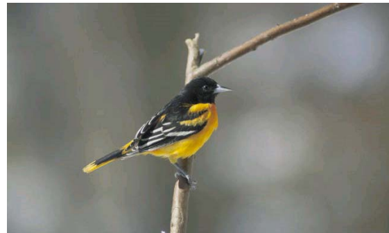
Baltimore Oriole