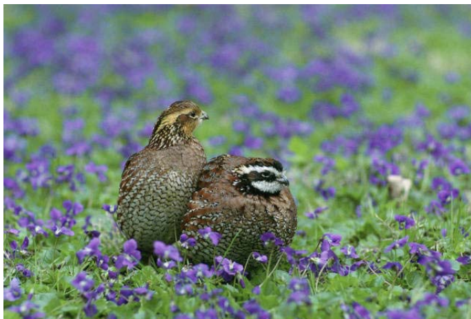
Northern Bobwhite