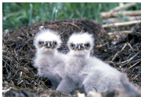
Bald Eagle chicks

Please send your examples to Chris Eberly ( ceberly@dodpif.org ) no later than December 15, 2009 .