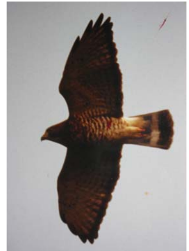
Broad-winged Hawk