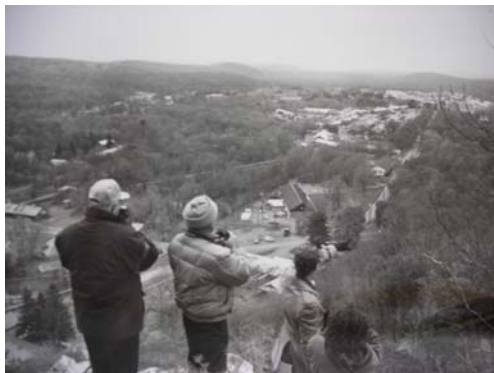
Hawkwatchers at Picatinny Arsenal

From early September through December, almost all birds of prey, or raptors, vacate their breeding grounds in search of more