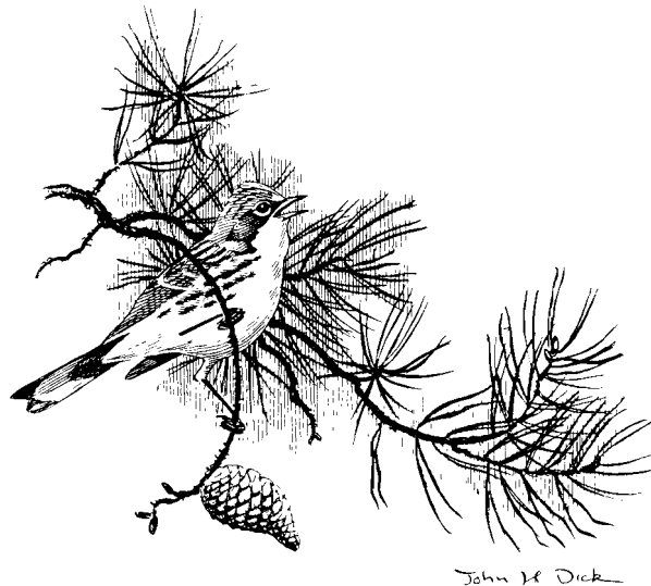
Figure 2. Adult male Kirtland's Warbler in typical breeding habitat. By J. H. Dick.

Phenology. Females and immature males do not sing ordinarily, but partial song noted in late summer by hatching-year male (Walkinshaw 1983), by captive male at 40 d, with whisper songs from 77 d onward (Berger 1968). Males sing in spring migration from South Carolina northward.